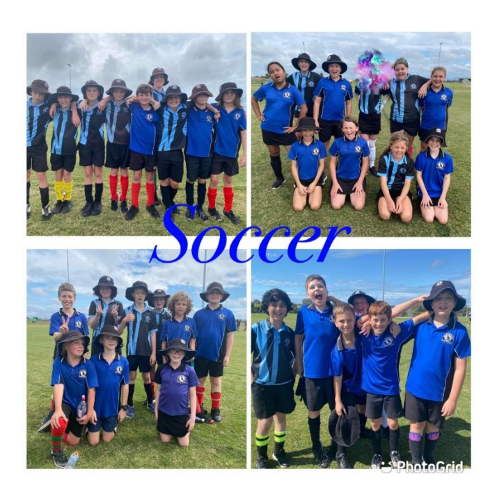
FIND KAWUNGAN STATE SCHOOL ON FACEBOOK