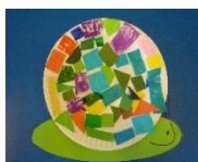
's' for snail

In Prep we have been busy learning our letter names and sounds. We have learnt the letter 's', 'a' and 't'. Here is some of our work.