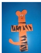
't' for tiger