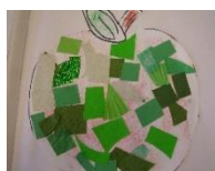
'a' for apple