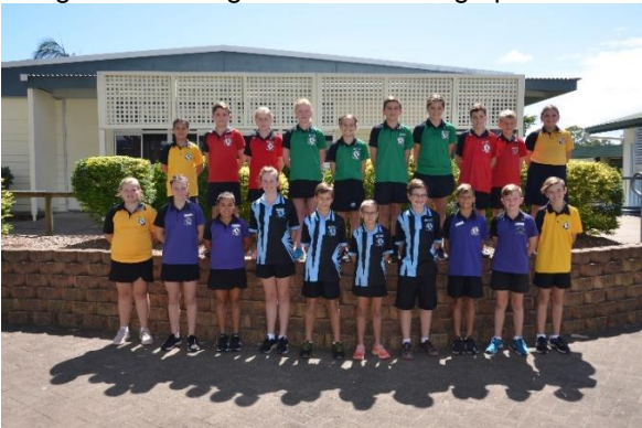
Our 2019 Student Leadership Team

Congratulations to all our student leaders on gaining their respective positions this year. On Monday these students were presented leadership badges and undertook their leadership oath in front of peers and family members. We look forward to watching them embrace the challenge of leadership and making significant contributions to Kawungan in 2019. It was lovely to meet with many of these student's parents at a morning tea following the student badge presentation.